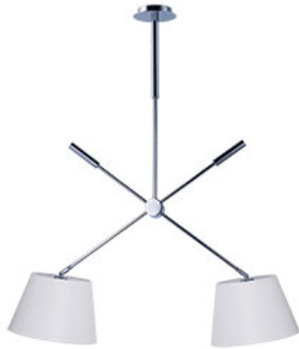
60144WAPC Hotel LED 2-Light Pendant