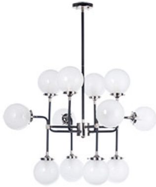
24727WTBKPN Atom 12-Light Pendant Lamp