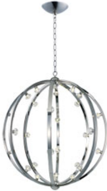
39108BCPN Equinox LED Pendant