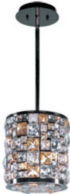
39793JCLB Fifth Avenue 3 -Light Mini Pendant