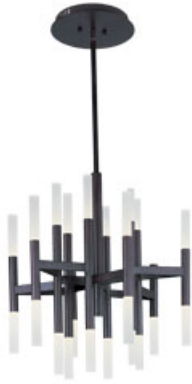
39758FTBZ Pinnacle LED 24-Light Pendant