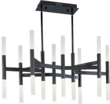
39754FTBZ Pinnacle LED 18-Light Pendant