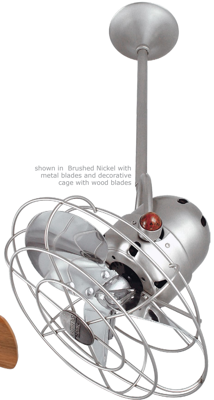
shown in Brushed Nickel with metal blades and decorative cage with wood blades

Unique and versatile, the fan head of the Bianca Direcional ceiling fan can be infinitely positioned in a 180-degree arc, forward and reverse, to provide maximum, directional airflow. The Bianca can be hung in small, awkward spaces or in front of HVAC ducts to make more efficient the heating, ventilation or air conditioning of any room. Constructed of cast aluminum, heavy spun and stamped steel, the Bianca Direcional carries a limited lifetime warranty.