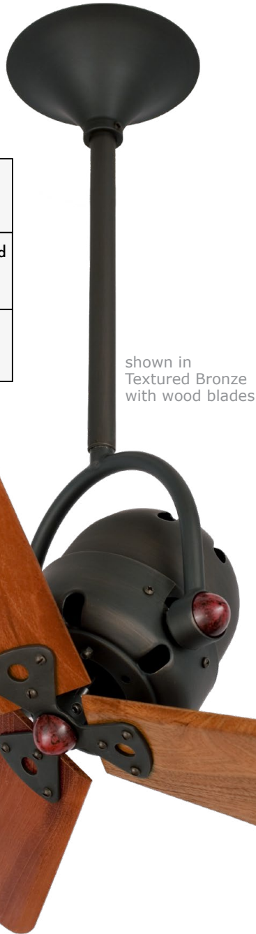
shown in Textured Bronze with wood blades