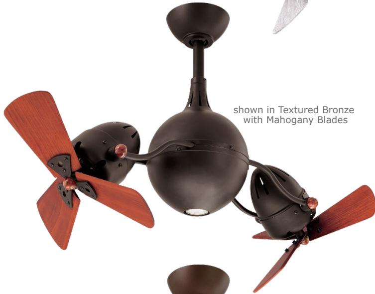
shown in Textured Bronze with Mahogany Blades