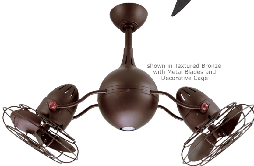
shown in Textured Bronze with Metal Blades and Decorative Cage