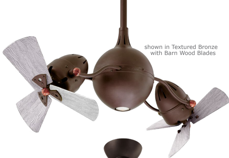
shown in Textured Bronze with Barn Wood Blades