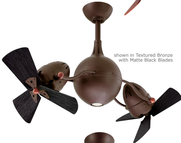
shown in Textured Bronze with Matte Black Blades