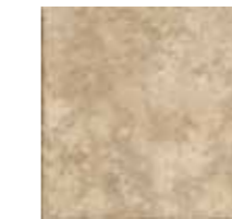
FB2A Creta 20"x20"