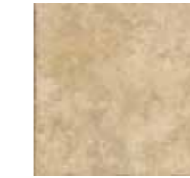
FB28 Acqua 20"x20"