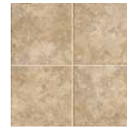
Floor: Creta 13"x13"

Intricate niches and indentations on the surface appear randomly formed by the earth's internal forces.