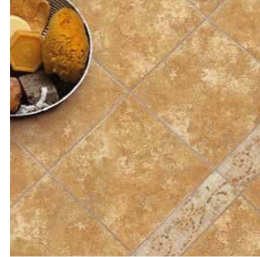
Floor: Elios 13"x13" - Serena Listelli 4"x13"