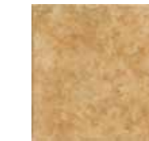
FB2B Elios 20"x20"