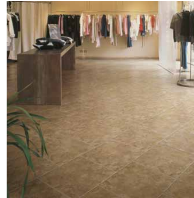
Floor: Argilla 20"x20"

Intricate niches and indentations on the surface appear randomly formed by the earth's internal forces.