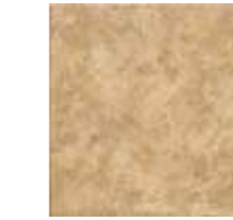
FB29 Argilla 20"x20"