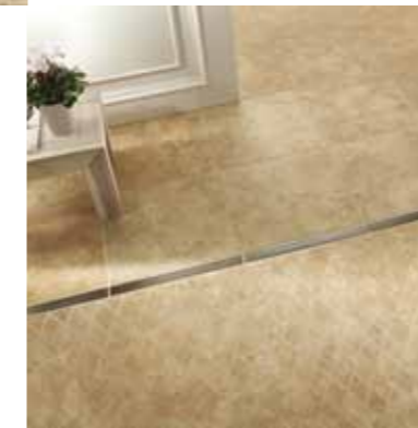
Floor: Acqua 13"x13" - Mosaic Diamond 2"x3½"