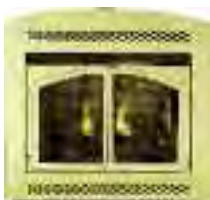
Classic faces available for VF/VFR/MCUF fireboxes