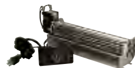
FA2 blower option for BUF fireboxes