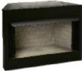
BU500 vent free firebox