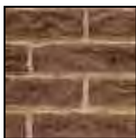
Tavern Brown firebrick