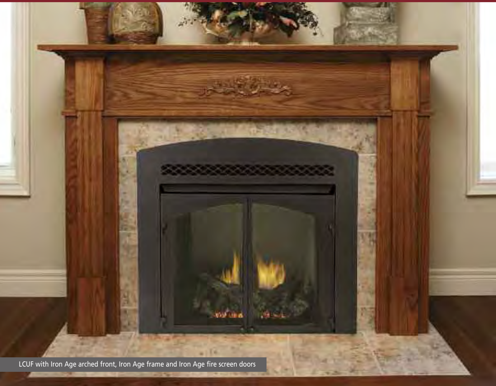
LCUF with Iron Age arched front, Iron Age frame and Iron Age fire screen doors