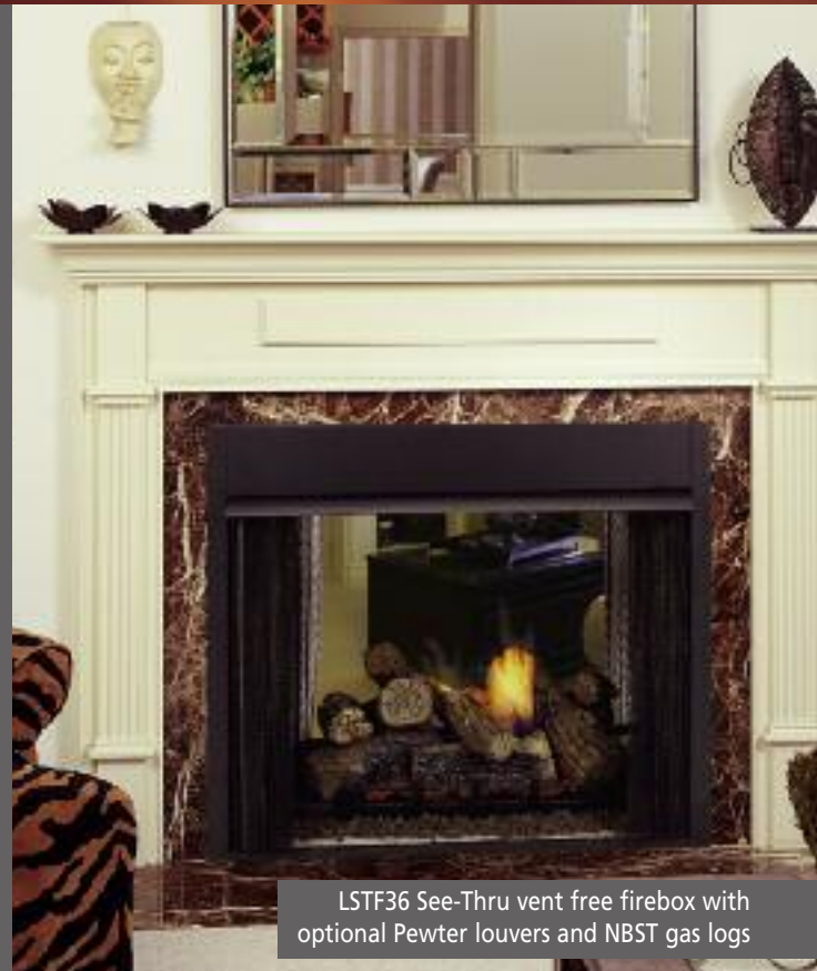
LSTF36 See-Thru vent free firebox with optional Pewter louvers and NBST gas logs