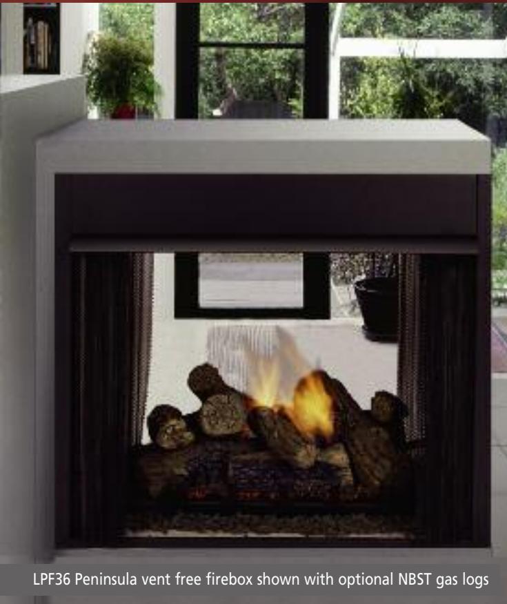
LPF36 Peninsula vent free firebox shown with optional NBST gas logs

Our Majestic vent free fireboxes also come in exciting designer styles that offer dynamic design applications. Available in See-Thru, Peninsula and Corner models, these sophisticated fireboxes add style and warmth to your rooms while maintaining a contemporary feel.