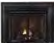
Manor faces available for VF/VFR fireboxes