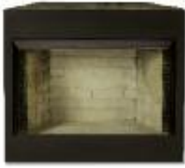
BU400 vent free firebox