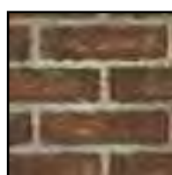
Cottage Red firebrick