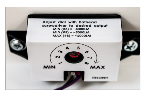
For ALO6 configurations