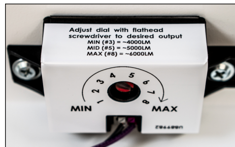
For AL06 configurations