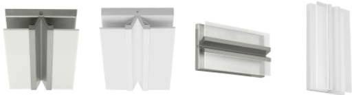
flush mount satin nickel flush mount white wall mount satin nickel wall mount white