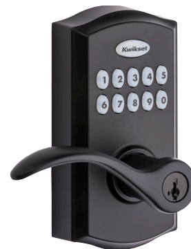
99550-004 Iron Black 514

FINISH AND LIFETIME WARRANTY MECHANICAL THREE YEAR ELECTRONIC WARRANTY