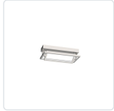
SF16216-BN Brushed Nickel