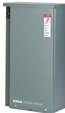
200 Amp with optional status indicator shown.