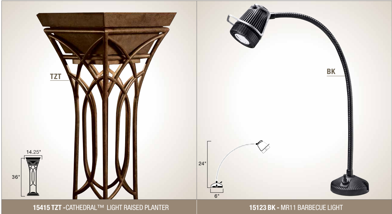
15415 TZT - CATHEDRAL™ LIGHT RAISED PLANTER