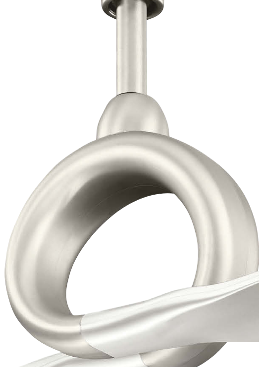
300168 NI Finish: Brushed Nickel Blades: Silver