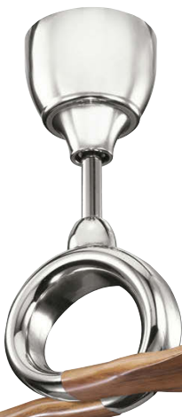
300168 PN Finish: Polished Nickel Blades: Walnut