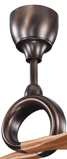
300168 OBB Finish: Oil Brushed Bronze™ Blades: Dark Oak