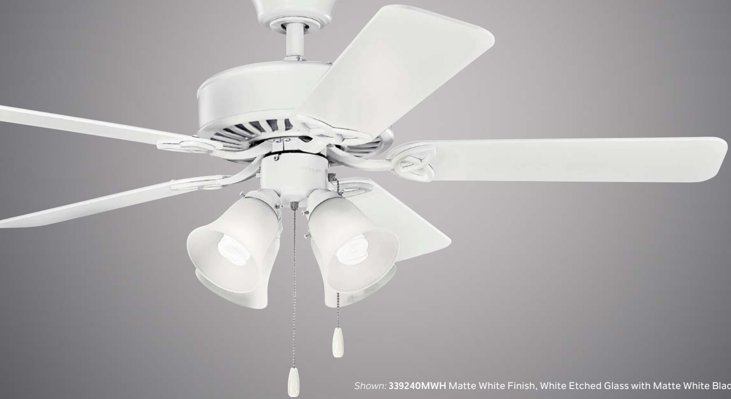
Shown: 339240MWH Matte White Finish, White Etched Glass with Matte White Blades