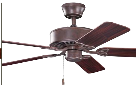
330100TZ Tannery Bronze™ Finish Teak Blades