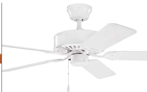
330100MWH Matte White Finish Matte White Blades