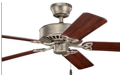
330100SGD Sterling Gold Finish Walnut Blades