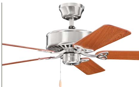
330100BSS Brushed Stainless Steel Finish Dark Oak Blades