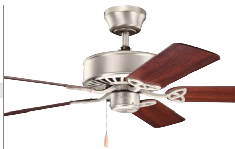
330100NI Brushed Nickel Finish Walnut Blades