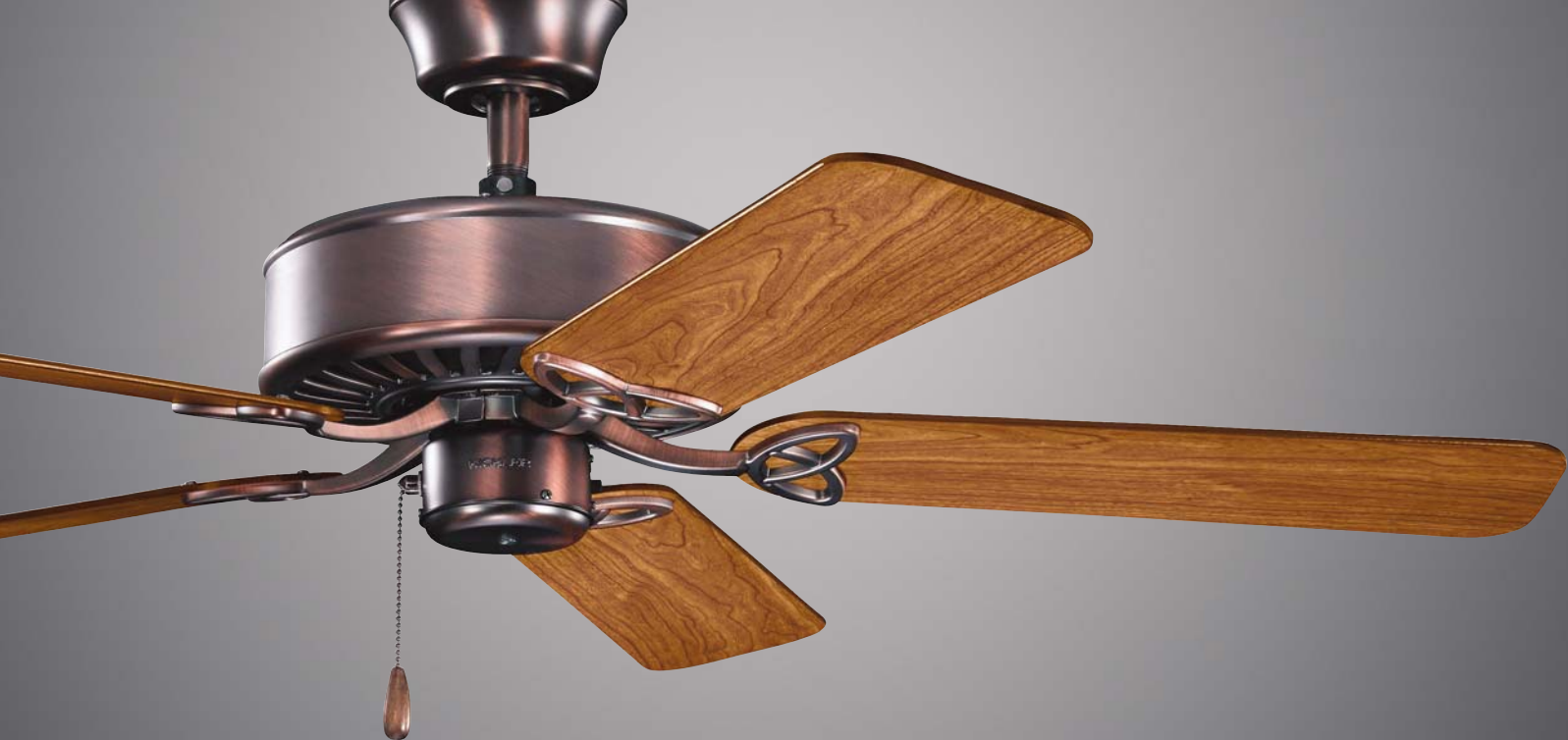
Shown: 330100OBB Oil Brushed Bronze Finish with Cherry Blades