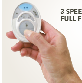
3-SPEED COOLTOUCH™ FULL FUNCTION