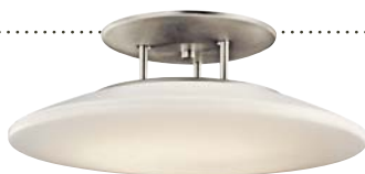
D | 10898 NI Semi Flush