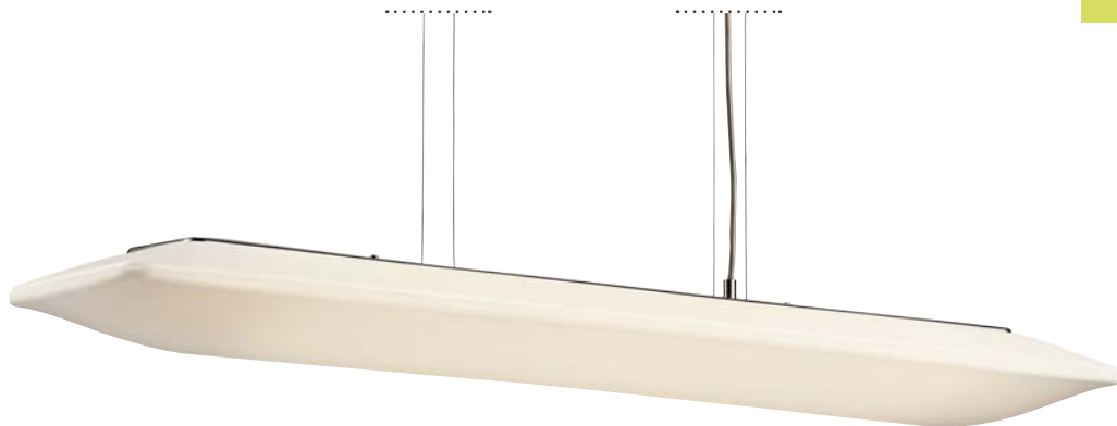
E | 10708 NI Linear Pendant