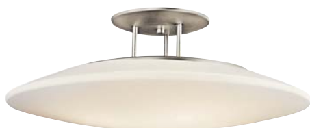
B | 10899 NI Semi Flush