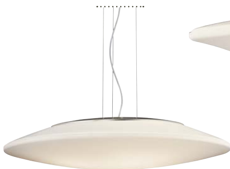
C | 10711 NI Pendant