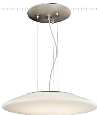
A | 10710 NI Pendant

BRUSHED NICKEL FINISH WITH MATTE WHITE ACRYLIC DIFFUSER