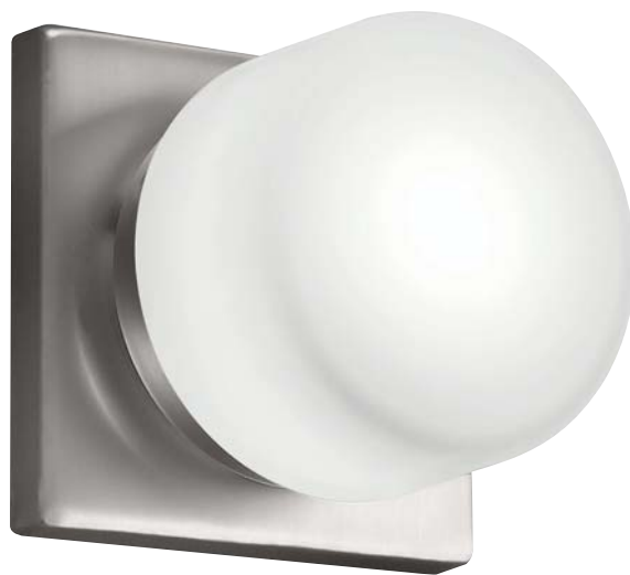
C | 10461 NI Wall Sconce ADA Compliant NOT TO SCALE