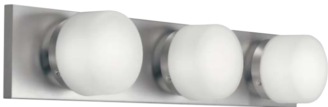
A | 10463 NI ADA Compliant

BRUSHED NICKEL FINISH WITH WHITE OPAL GLASS