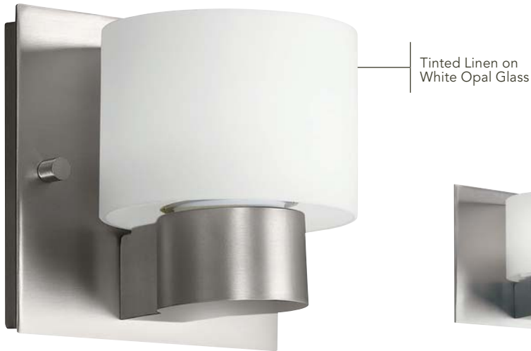
A | 10402 NI, OZ Wall Sconce ADA Compliant NOT TO SCALE

BRUSHED NICKEL FINISH WITH WHITE OPAL GLASS OR OLDE BRONZE® FINISH WITH TINTED LINEN ON WHITE OPAL GLASS