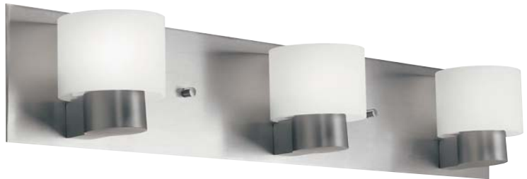
B | 10403 NI ADA Compliant