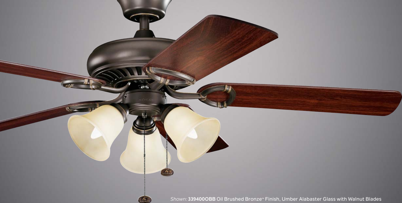
Shown: 339400BB Oil Brushed Bronze™ Finish, Umber Alabaster Glass with Walnut Blades