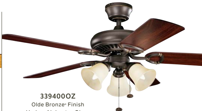
339400OZ Olde Bronze® Finish Umber Alabaster Glass Walnut Blades