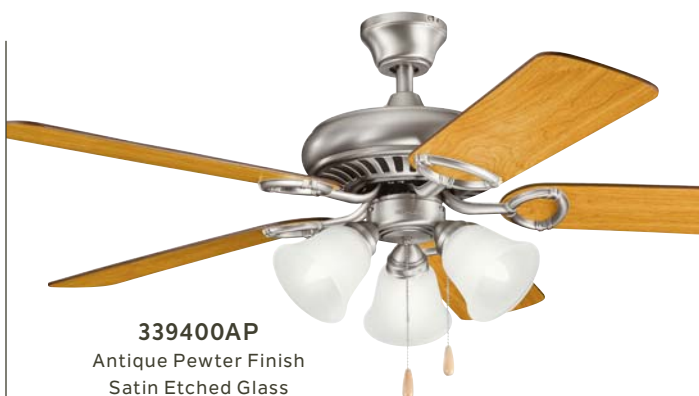
339400AP Antique Pewter Finish Satin Etched Glass Light Cherry Blades