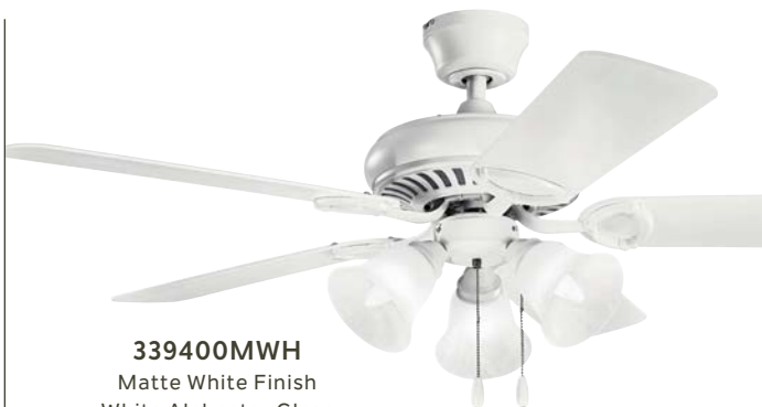
339400MWH Matte White Finish White Alabaster Glass Matte White Blades