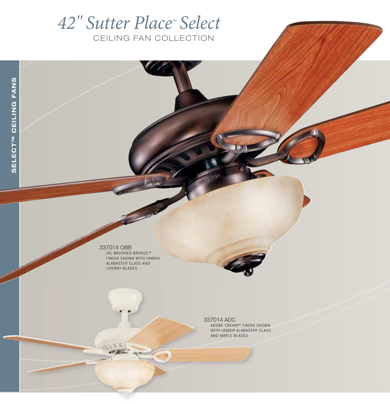
SEE ADDITIONAL FINISH OPTIONS ON PAGES S288-S289.