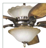
380002 OLZ Bowl Light Fixture Golden Iridescent Glass (3) E-12, 40-W, B-10 Lamp Included 7.00"H x 13.50"D