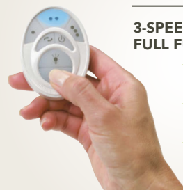
3-SPEED COOLTOUCH™ FULL FUNCTION