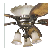
380003 OLZ 3-Light Pendant Golden Iridescent Glass (3) E-12, 60-W, B-10 Lamp Included 8.00"H x 13.00"D