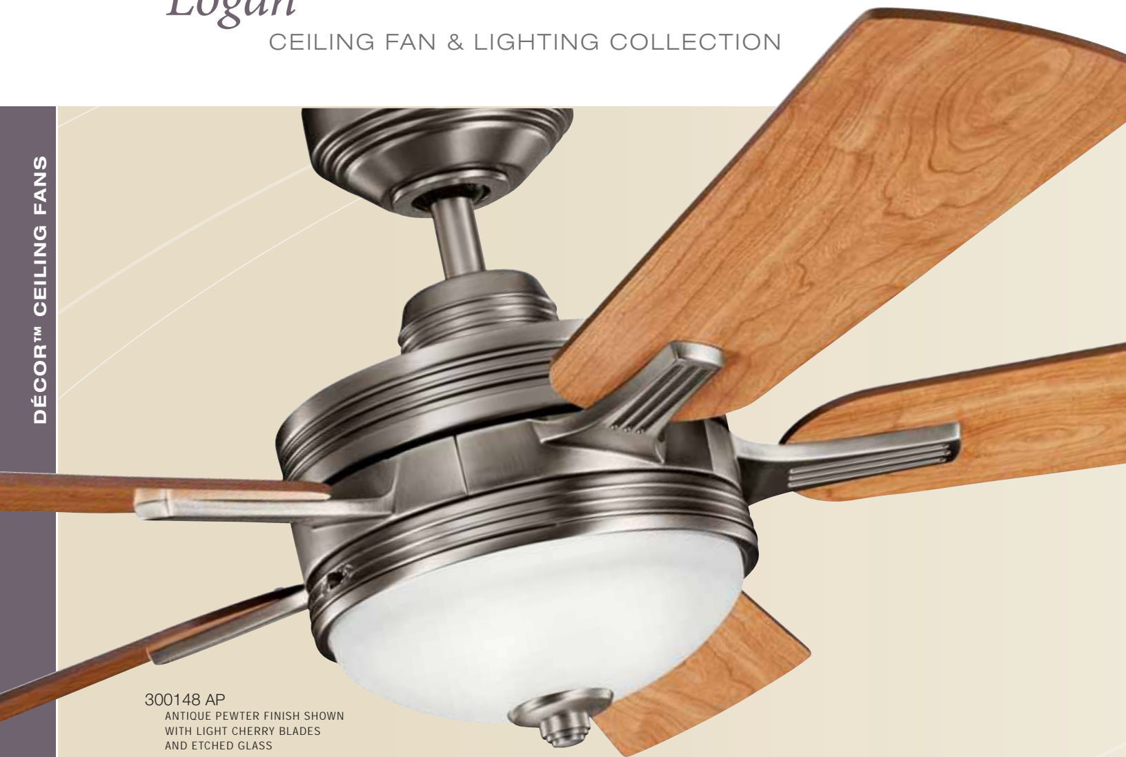
300148 AP ANTIQUPE PEWTER FINISH SHOWN WITH LIGHT CHERRY BLADES AND ETCHED GLASS