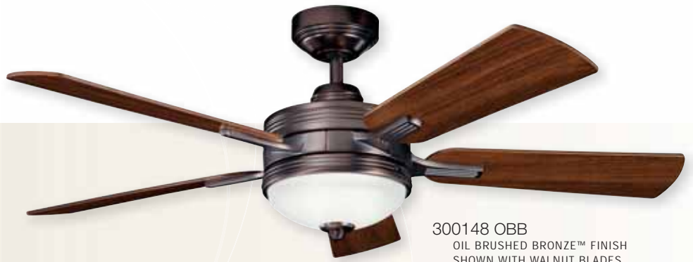
300148 OBB OIL BRUSHED BRONZE™ FINISH SHOWN WITH WALNUT BLADES AND ETCHED GLASS