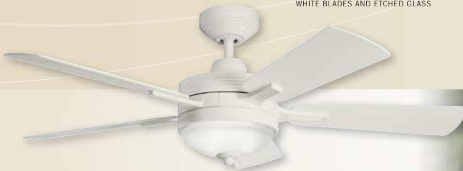
300148 SNW SATIN NATURAL WHITE FINISH SHOWN WITH SATIN NATURAL WHITE BLADES AND ETCHED GLASS