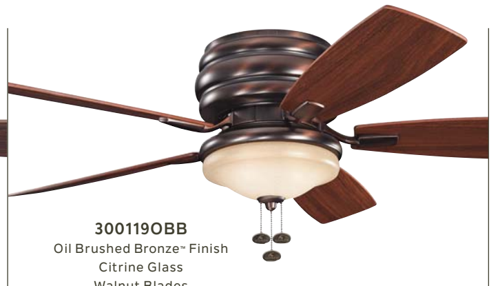
300119OBB Oil Brushed Bronze™ Finish Citrine Glass Walnut Blades