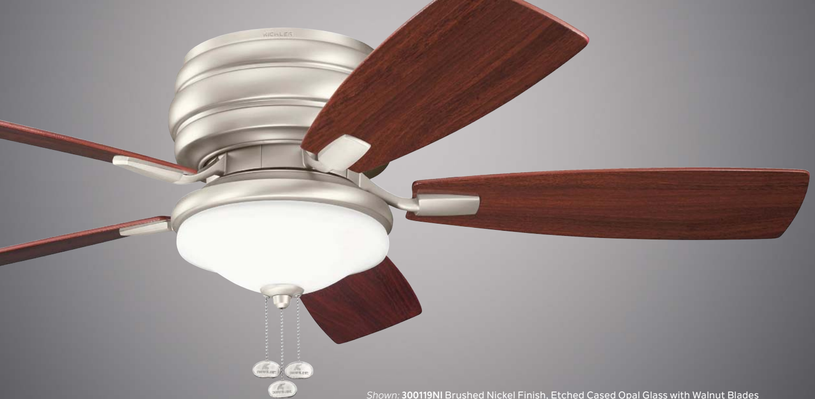
Shown: 300119NI Brushed Nickel Finish, Etched Cased Opal Glass with Walnut Blades