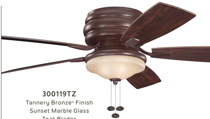
300119TZ Tannery Bronze™ Finish Sunset Marble Glass Teak Blades