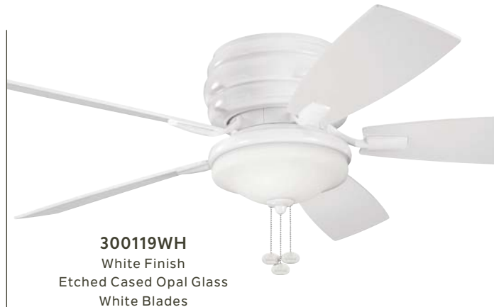
300119WH White Finish Etched Cased Opal Glass White Blades