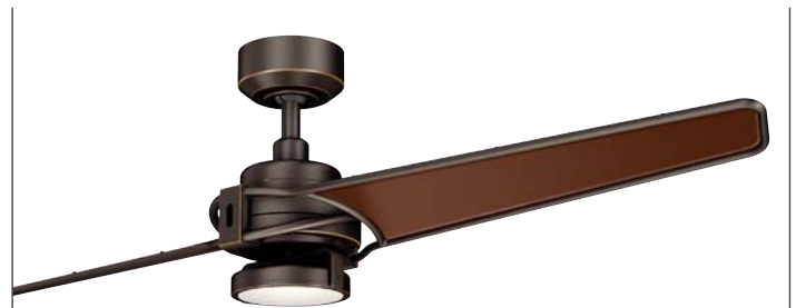
300702OZ Olde Bronze® Finish Oil Brushed Bronze™ Blades