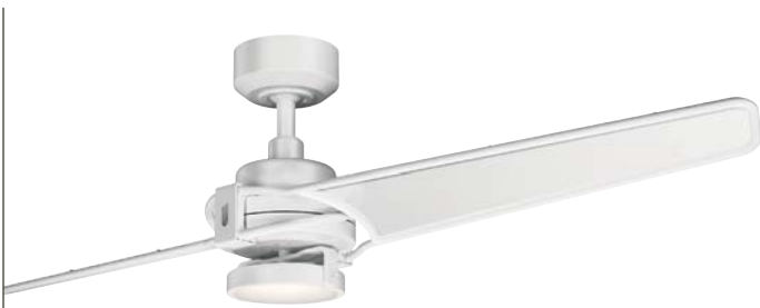
300702MWH Matte White Finish White Blades