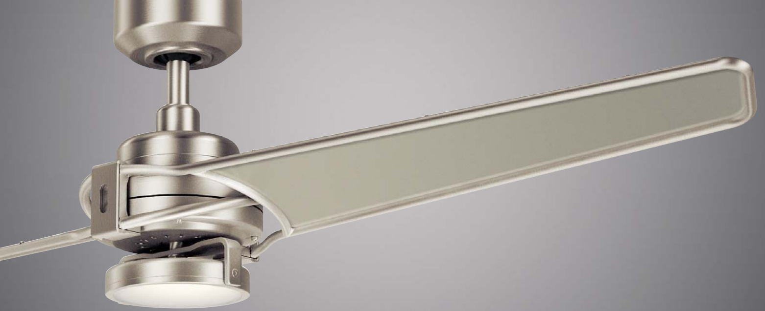
Shown: 300702NI Brushed Nickel Finish with Champagne Blades