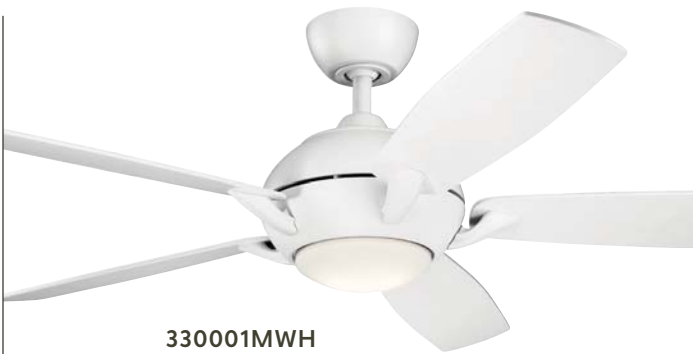
330001MWH Matte White Finish Etched Cased Opal Glass Matte White Blades