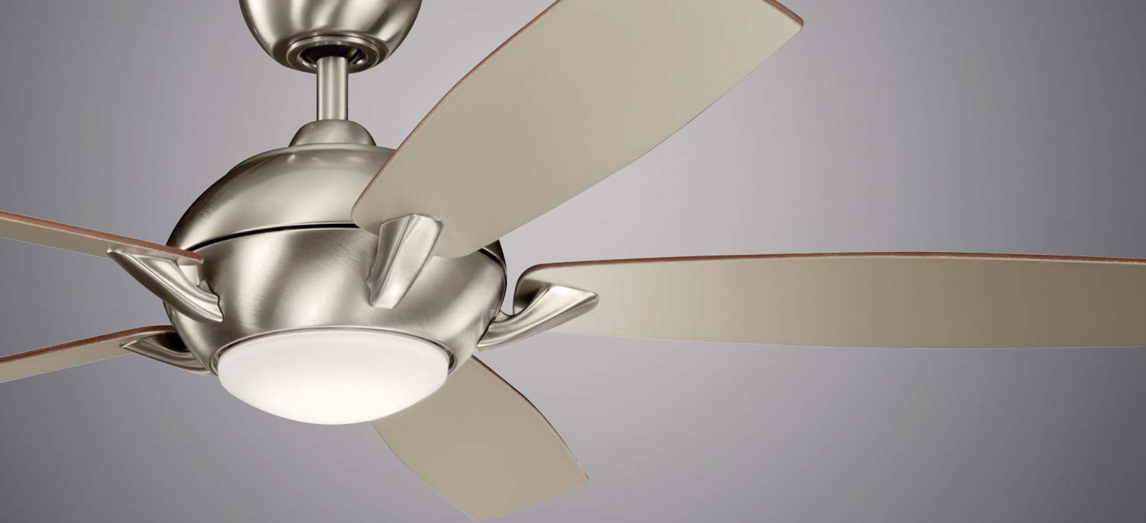
Shown: 330001BSS Brushed Stainless Steel Finish, Etched Cased Opal Glass with Silver Blades