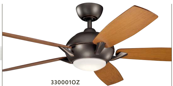
330001OZ Olde Bronze® Finish Etched Cased Opal Glass Cherry Blades