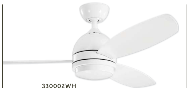
330002WH White Finish Etched Cased Opal Glass White Blades