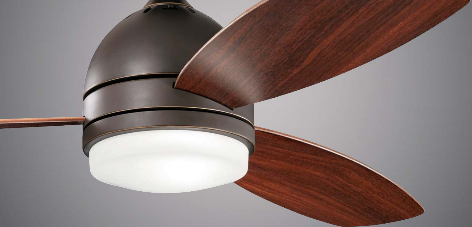
Shown: 330002OZ Olde Bronze® Finish, Etched Cased Opal Glass, Walnut Blades