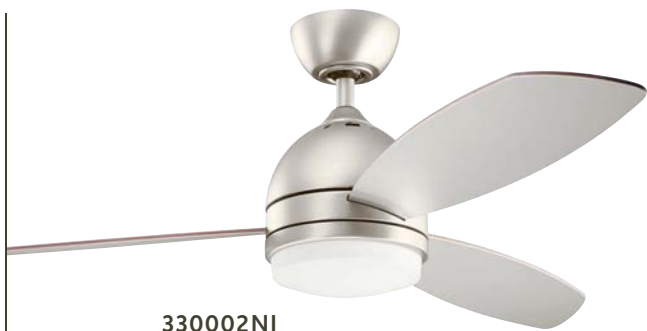
330002NI Brushed Nickel Finish Etched Cased Opal Glass Silver Blades