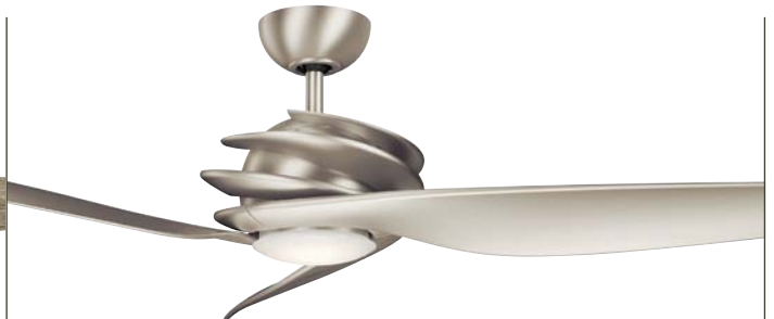
300700NI Brushed Nickel Finish Silver Blades