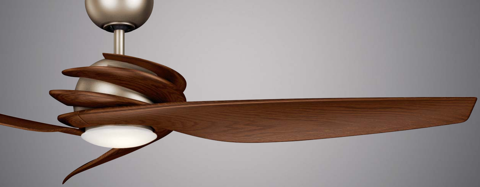
Shown: 300700AP Antique Pewter Finish with Walnut Blades