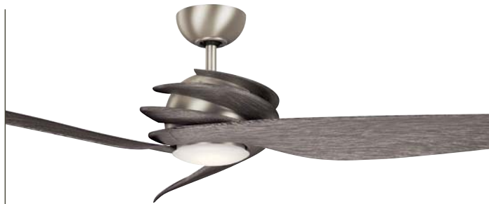
300700NI7 Brushed Nickel Finish Driftwood Blades