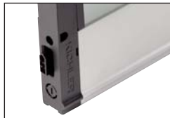
NIT Textured Nickel