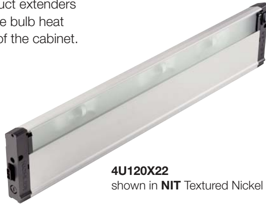
4U120X22 shown in NIT Textured Nickel

Each fixture features product extenders that help dissipate possible bulb heat away from the underside of the cabinet.