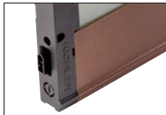
BZT Textured Bronze