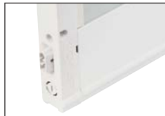
WHT Textured White