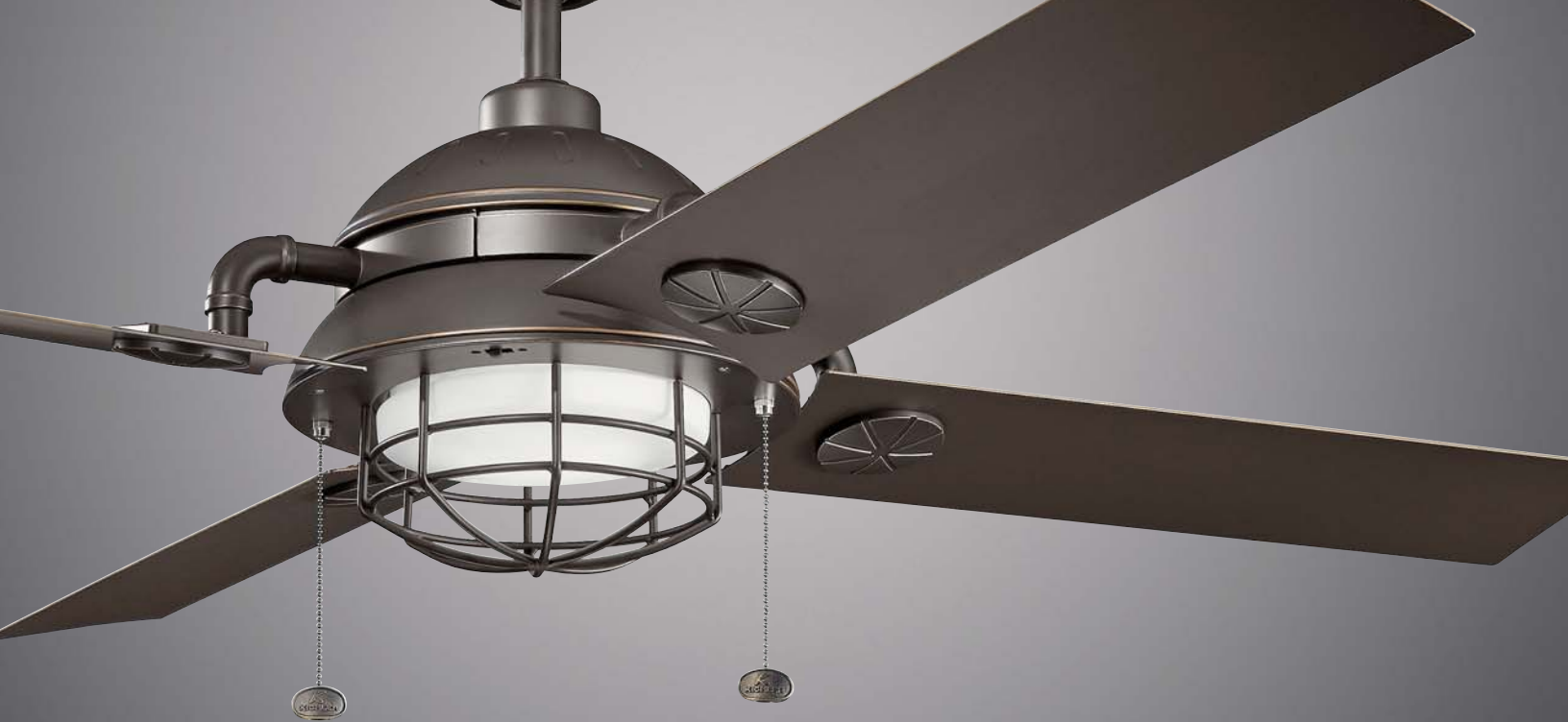
Shown: 310136OZ Olde Bronze® Finish with Olde Bronze® Blades