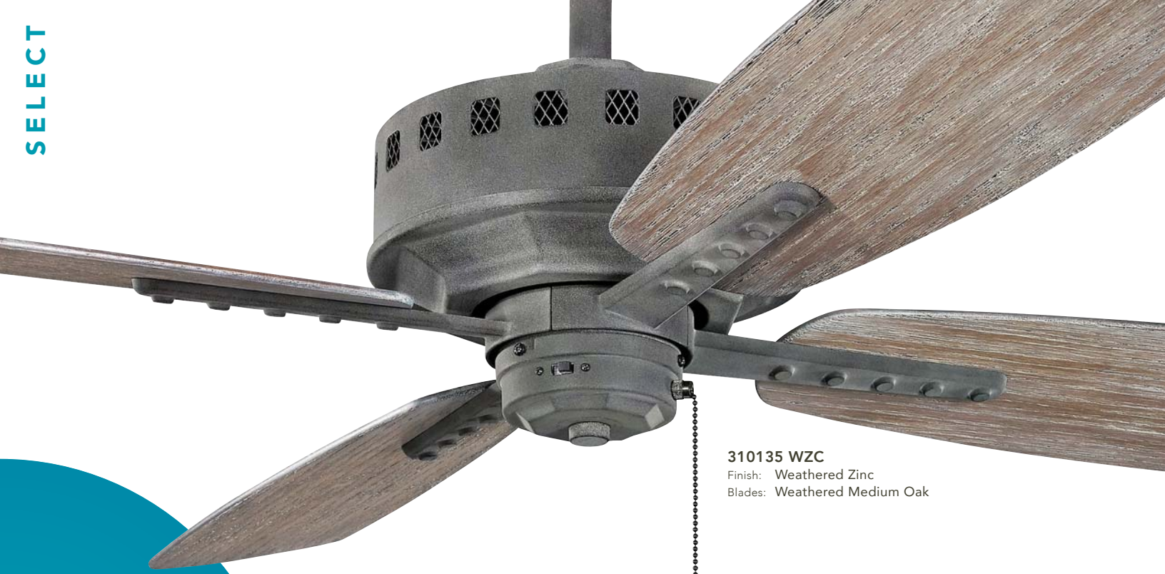
310135 WZC Finish: Weathered Zinc Blades: Weathered Medium Oak