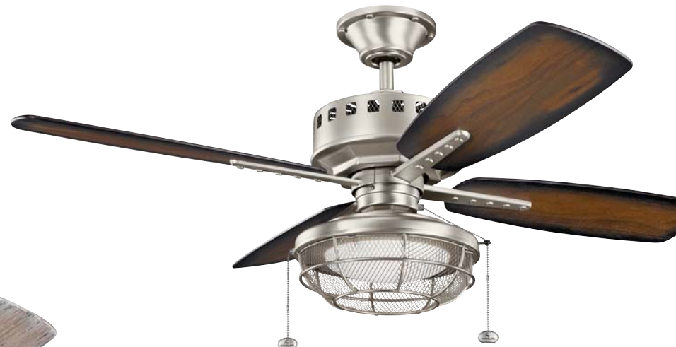
310135 NI Finish: Brushed Nickel Blades: Walnut Shadowed 370044 NI Light Kit: Etched Cased Opal Glass (Sold Separately)