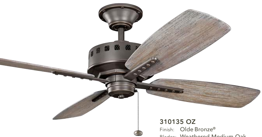
310135 OZ Finish: Olde Bronze® Blades: Weathered Medium Oak