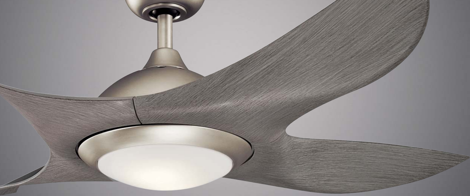
Shown: 300209NI Brushed Nickel Finish with Driftwood Blades