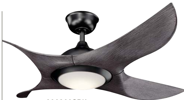
300209SBK Satin Black Finish Dark Driftwood Blades