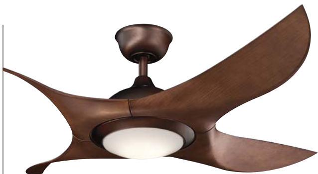
300209OBB Oil Brushed Bronze™ Finish Walnut Blades