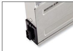
SS Stainless Steel