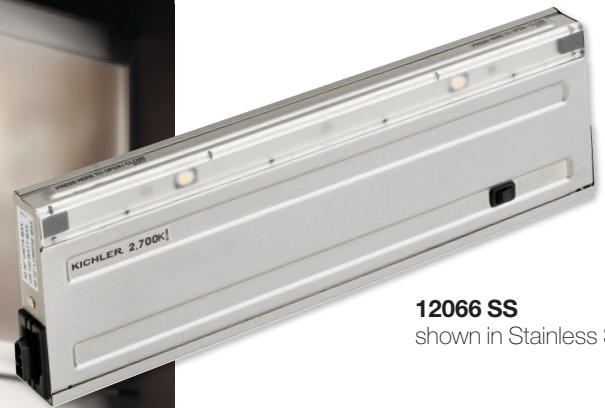
12066 SS shown in Stainless Steel