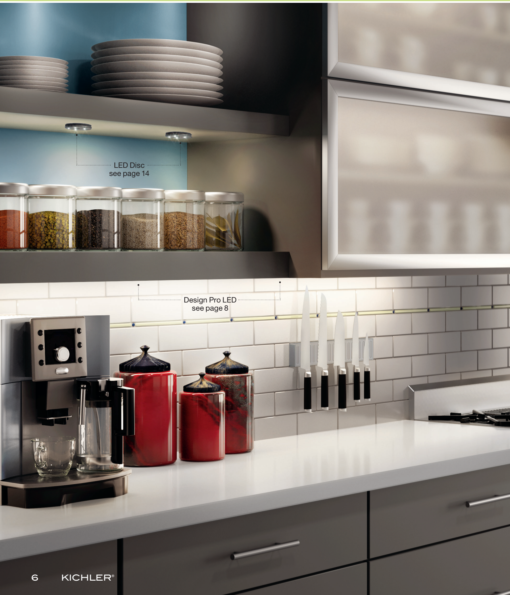
LED Disc see page 14