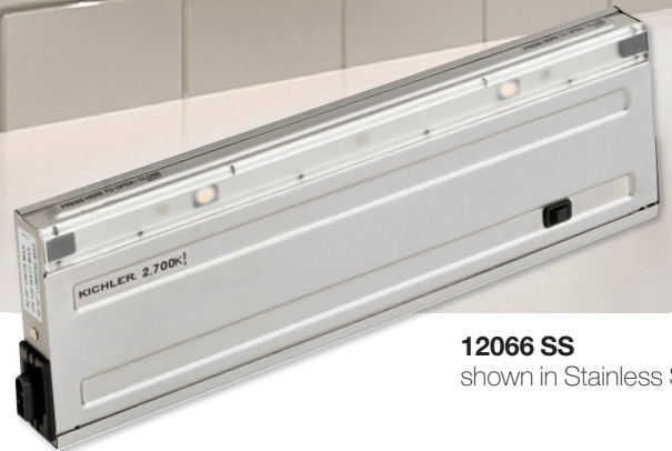
12066 SS shown in Stainless Steel