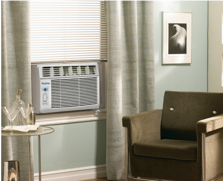
Fits windows 23" minimum width to 36" maximum width.