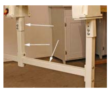
The stand extension kit includes the center post, adjustable mount plate and crossbar. All of the parts bolt up to the JWL-1220S stand.

A specially designed extension kit JWL1220SE enlarges the JWL-1220S stand to accommodate the JET JWL-1220 when equipped with the JWL-1220E bed extension. Made from the same materials as the JWL-1220S stand, all of the required parts and fasteners are included to make this conversion easy without sacrificing stability.