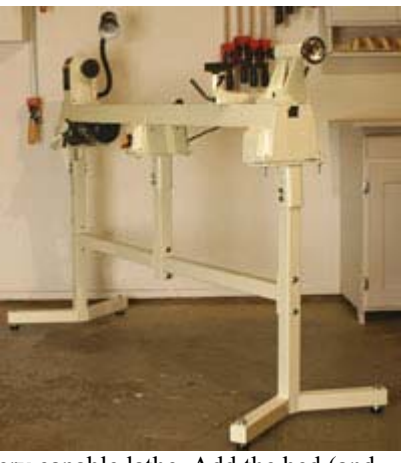
In its standard form, (left) the JWL-1220 is a very capable lathe. Add the bed (and stand) extension (left) and its between centers capacity rivals that of many "full-sized" lathes!

JET JWL-1220 more than fills the void between traditional mini and full-sized lathes. Add the JWL-1220BE 28" bed extension and the JET JWL-1220 between centers capacity expands to nearly 50", rivaling that of much larger and substantially more expensive woodturning lathes.