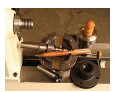
The 1X8 spindle thread and #2 Morse taper make the JWL-1220 compatible with a huge range of accessories.

The JET JWL-1220 is designed to be compatible with a huge range of commonly used accessories. The spindle and tailstock both accept tooling with the popular #2 Morse taper. The spindle has equally popular 1 X 8 threads. Using these popular sizes mean you can use tooling and accessories you already have. They also mean finding specialized accessories in the future will be easy and economical.