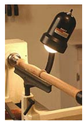
The built-in task light on a flexible arm makes it easy to see fine detail work.

We added a built-on task light, mounted on a positionable flexible arm to the JET JWL-1220 to eliminate these problems. The task light draws its current from the JET JWL-1220 wiring so there is no extra cord or socket required. The task light also has its own on/off switch so it can be used only when needed.