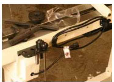
The basic JWL-1220 package includes all these accessories as standard equipment!

The JET JWL-1220 comes with a full set of popular accessories and a few that are not so common. A four-wing spur drive, quality ball bearing live center, knockout rod, 6"- tool rest and 3"-diameter faceplate are included with the JET JWL-1220.