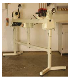
Shown with the extension kit installed, the JWL-1220S stand makes a very stable platform for the JWL-1220 lathe.

The JWL-1220S comes with rubber tipped adjustable leveling feet to dampen vibrations and resist moving. The lathe mounting plates are adjustable so spindle height can be set to between 43 and 45" above the floor for maximum comfort.