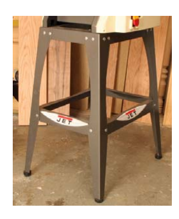
The optional stand kit lets you use the JET 8" Jointer/Planer as a stand alone unit.

If you have a small shop or workspace, the JET 8" Jointer/Planer could be for you. Despite its space saving footprint, the JET 8" Jointer/Planer includes many full-sized machine features, accuracy and power. The user-friendly features mean you will be up and running in no time.