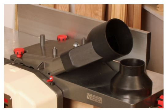
The dust collection hood is used for both jointing (here) and planing. It attaches using the same two finger operated knobs in both modes. Note the hose adapter that allows using standard 4"-diameter hose or 2-1/2"-diameter shop-vac hoses.

The JET 8" Jointer/Planer comes with a single dust shroud assembly that can be installed for either jointing or planer functions. This chute is attached using finger-operated knobs that make installation fast and tool free. The dust shroud is also designed as a safety interlock for the jointer-planer. This means the machine will not operate unless the dust shroud is installed in either the jointing or planning mode.