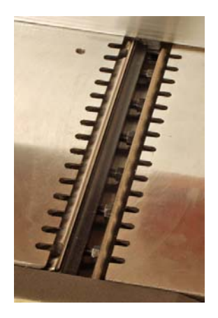
The twin knife system is designed to be consistent yet easy to adjust.

This cutterhead is used for both jointing and planning operations. The large diameter and mass of the all steel cutterhead body adds considerable inertia that helps keep the JET 8" Jointer/Planer cutting smoothly.