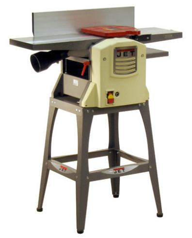
The JET 8" Jointer/Planer packs lots of capability into a space and costsaving package. (Shown with optional stand.)

The JET 8" Jointer/Planer is powered by a 13A, 120V (only) motor. A paddle-style switch controls the motor. This switch has a removable "key" that helps prevent usage of the machine when you are not present. A push button next to the paddle switch resets the automatic thermal protection circuit.