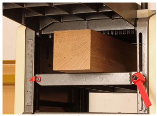
Despite its overall size, the JET 10" Jointer/Planer has a very useful capacity range that will handle the needs of even active home woodworking shops.

The planer table surface is 17-1/2" long (with the included extension table) by 8-1/2" wide. The table is raised and lowered with a hand crank that plugs into the top of the JET 8" Jointer/Planer. A handy scale next to the planer infeed opening shows the current table to knife distance and makes setup fast and easy. The planer table moves up and down on four lead screws, one in each corner of the main cabinet for maximum stability. The table is secured for making cuts with a single locking handle.