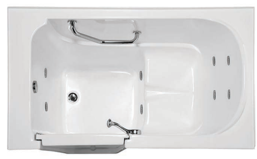
*Tub must be set in mortar base*

Adding multiple systems/options may require equipment to stick out from tub deck or be installed remotely