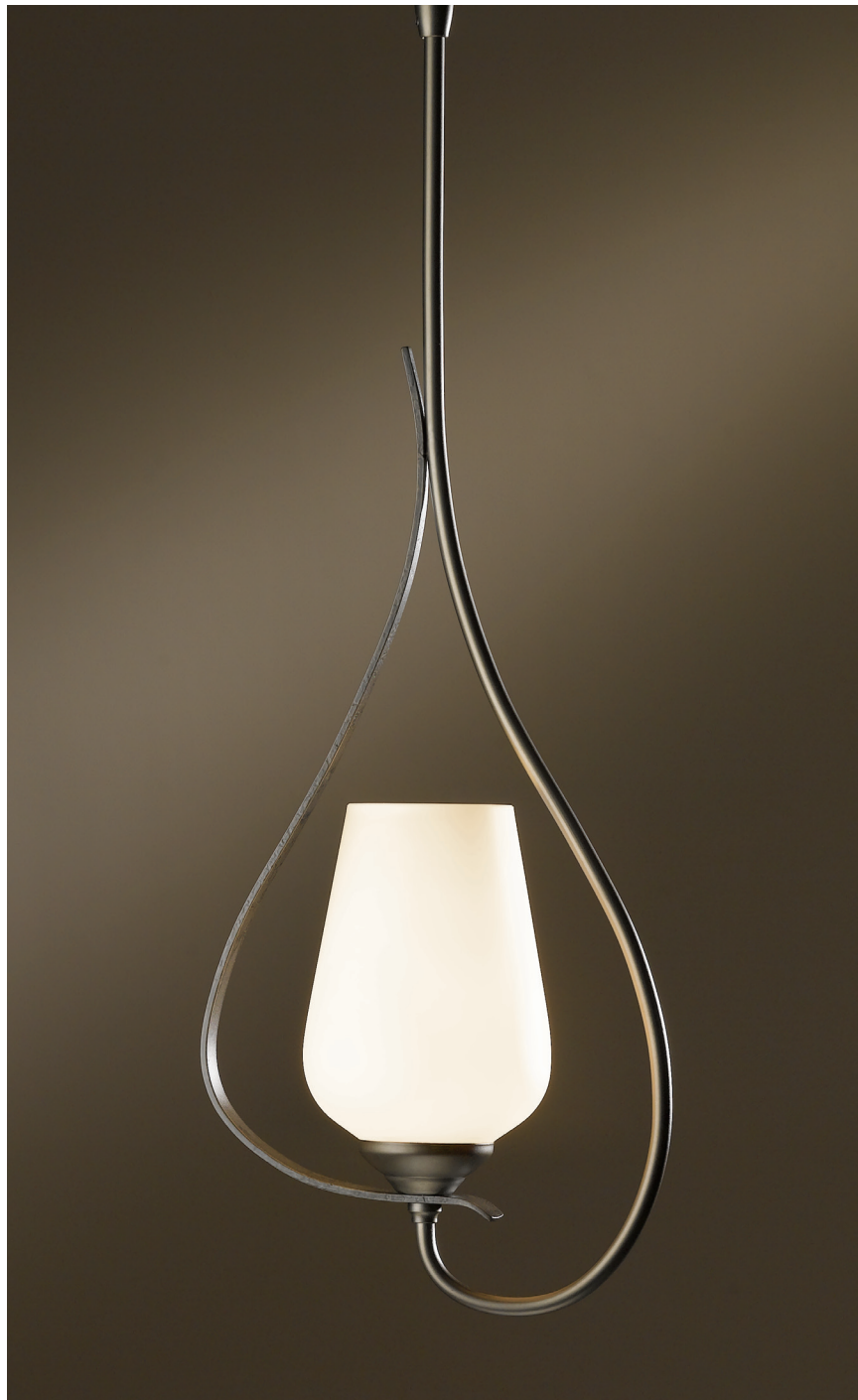
18-305 FLORA PENDANT As shown: 18-305-332-07-G303