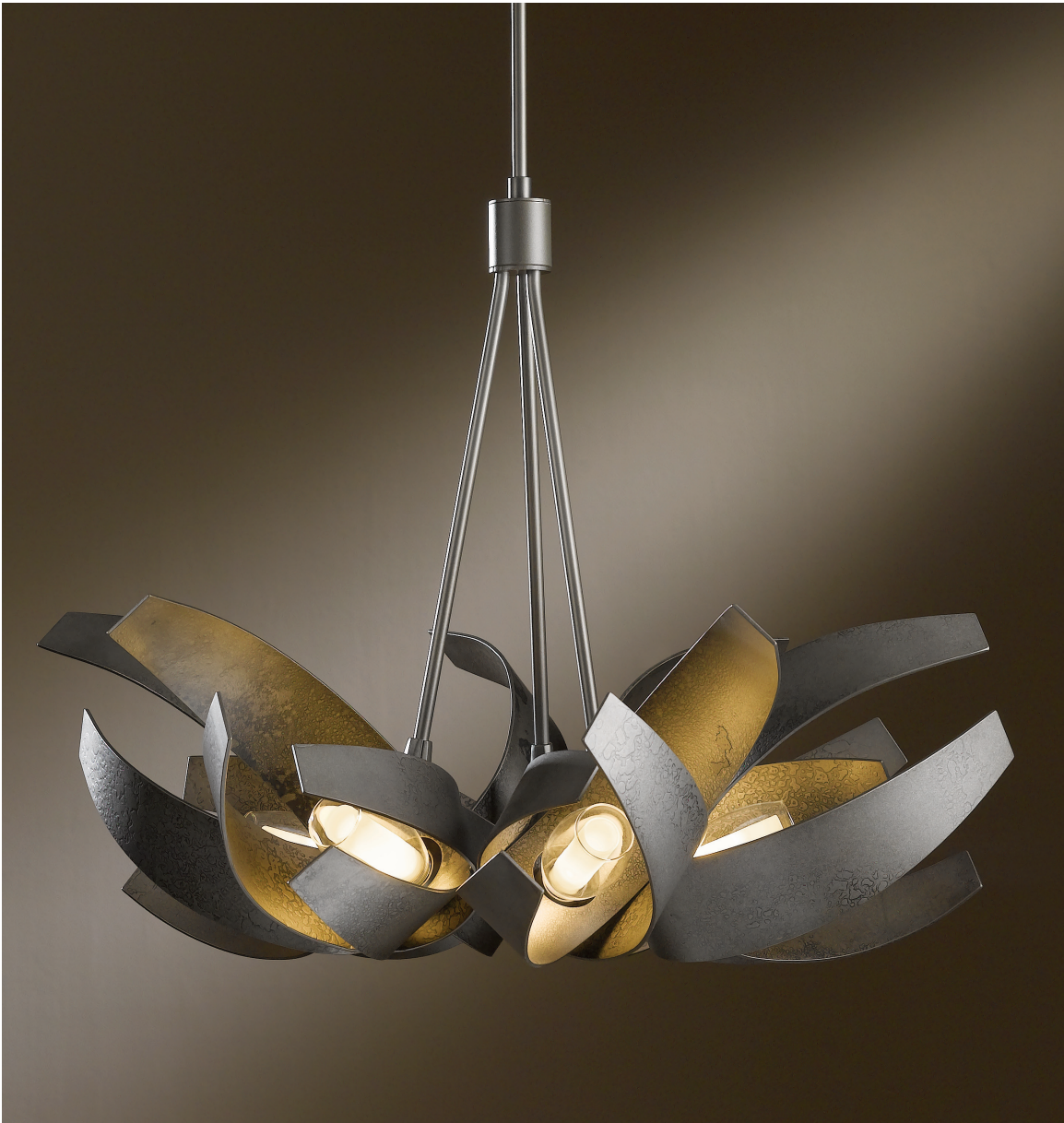
13-6501 CORONA PENDANT As shown: 13-6501-07