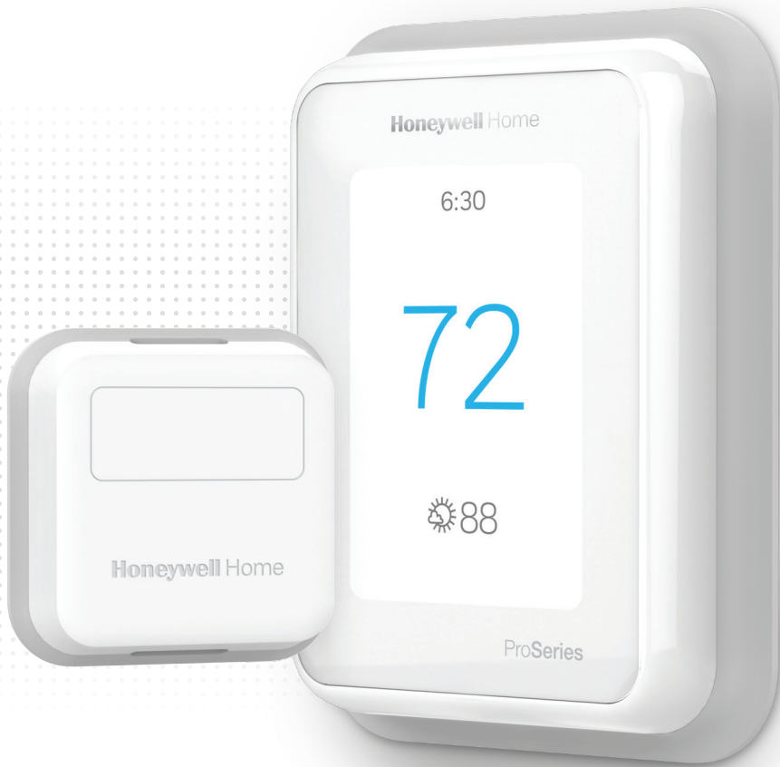
T10 Pro Smart Thermostat with RedLINK™ Room Sensor

Meet the next generation of everyday comfort solutions.