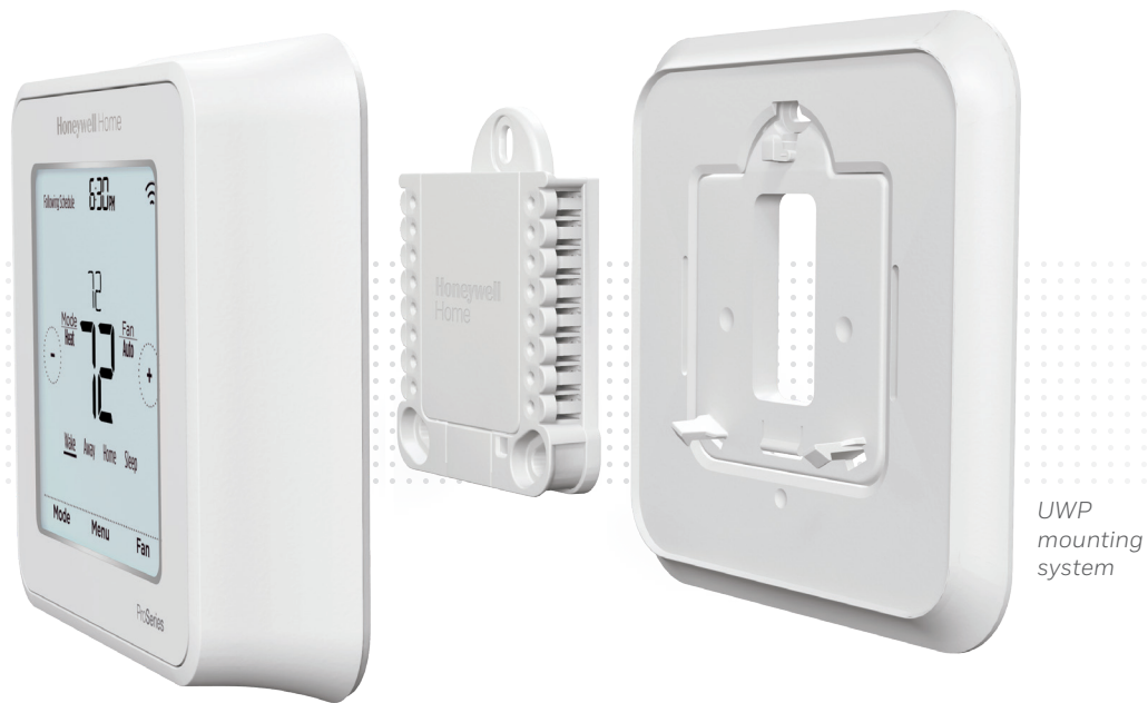
UWP mounting system