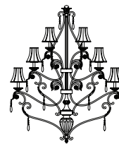
Drawing 1 - Fixture Assembly