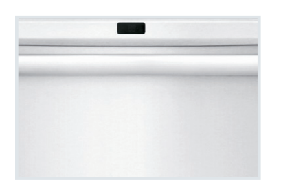
Quietest Dishwasher in Its Class<sup>3</sup> Quietest dishwasher, so it won't interrupt your time at home.