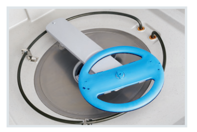
Excellent Cleaning Performance Exclusive OrbitClean™ Technology provides 4 times better water coverage and a clean no other dishwasher can beat.<sup>1</sup>