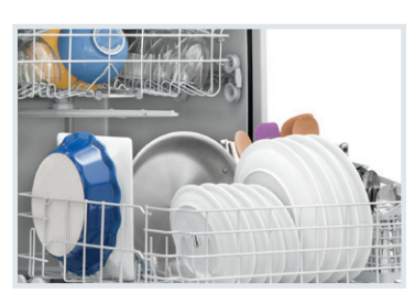
Best Drying Performance<sup>2</sup> With SaharaDry™ there's no need to towel-dry before putting dishes away.