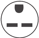
Plug Type (NEMA) 6-15P

1 Warranty 5 year sealed system/1 year full parts and labor.