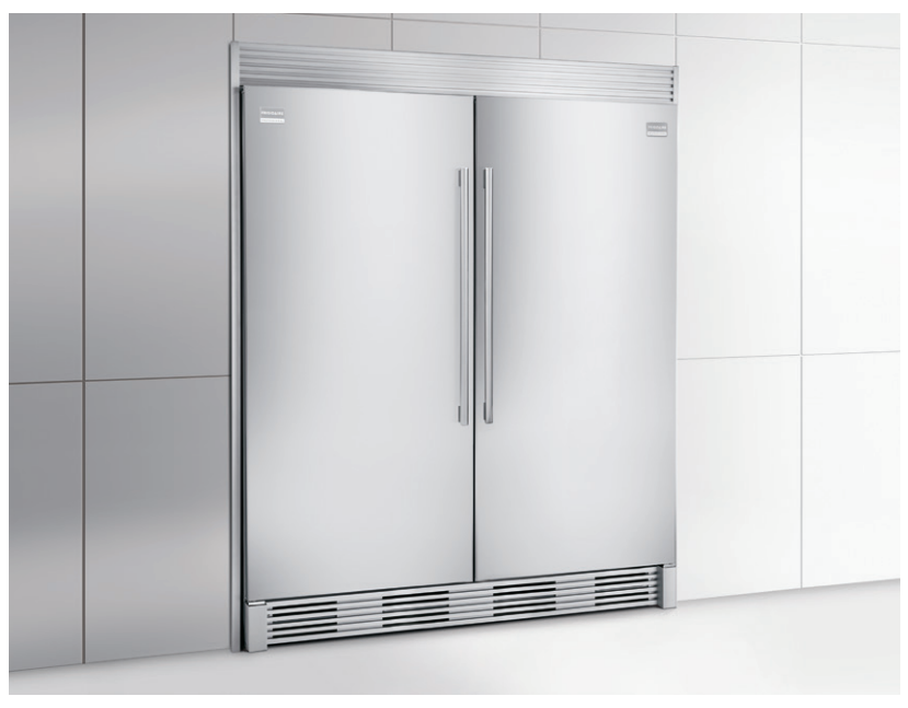
Shown with companion, All-Refrigerator model FPRH19D7LF and optional Double Louvered Trim Kit (TRIMKITEZ2).