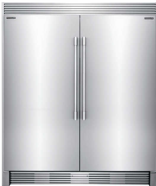
Shown with companion, All-Freezer model FPFU19F8RF and optional coordinated Dual 75" Louvar Trim Kit (TRIMKITEZ2).