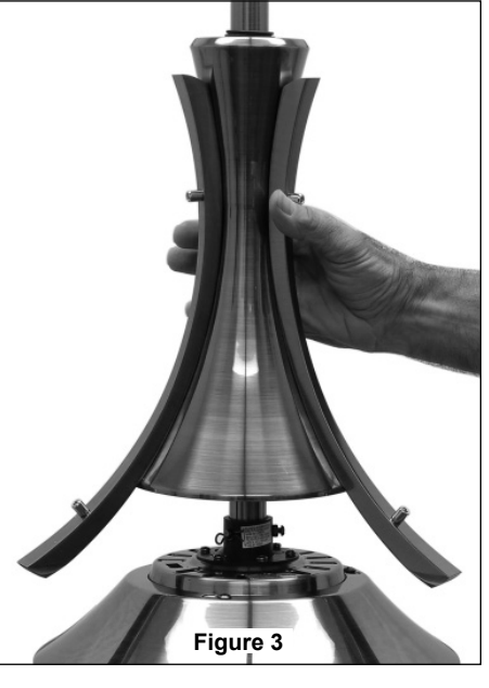
3. Carefully install the decorative sleeve by seating it onto the top of the motor housing.